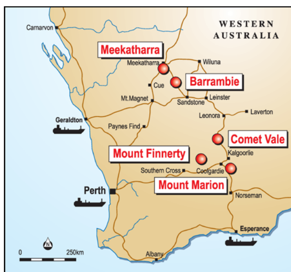
Figure 3 Project Locations

In addition during the quarter 722,831 ordinary shares were issued to eligible employee following the vesting of performance rights pursuant to the Reed Resources Ltd performance rights plan.